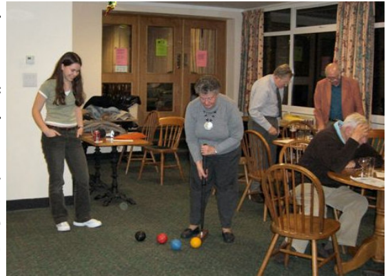
playing yellow to the target 5 yards away

The winning teams received no more than a round of applause but the evening was a lot of fun.