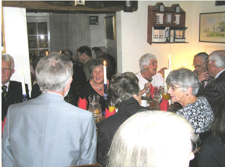
Part of the large crowd enjoying dinner

Thirty three members and their partners attended the Annual Dinner held on the 10th November at Time for